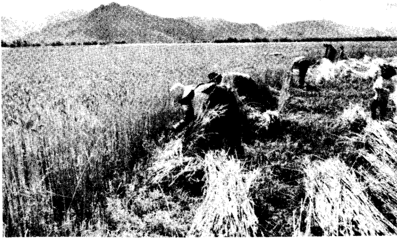
Farmers in Doilungdeqen County are reaping wheat.