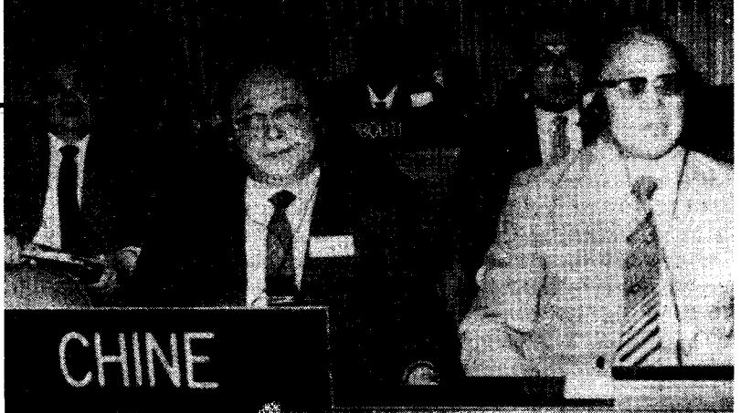
Chinese delegates, headed by Vice-Minister of Foreign Economic Relations and Trade Wang Wendong (middle), attend the conference on the least developed countries sponsored by the United Nations in Paris in September 1990.

Environmental protection has become a major concern of the entire world. Last year the United Nations continued to make extensive preparations for the convocation of an environment and development conference in 1992. Last year the General Assembly also adopted a resolution, calling for this conference to be held at the head-of-government level. In addition, under the sponsorship of the UN World Meteorological Organization, the second climatic conference was held last October and adopted the Ministers' De-