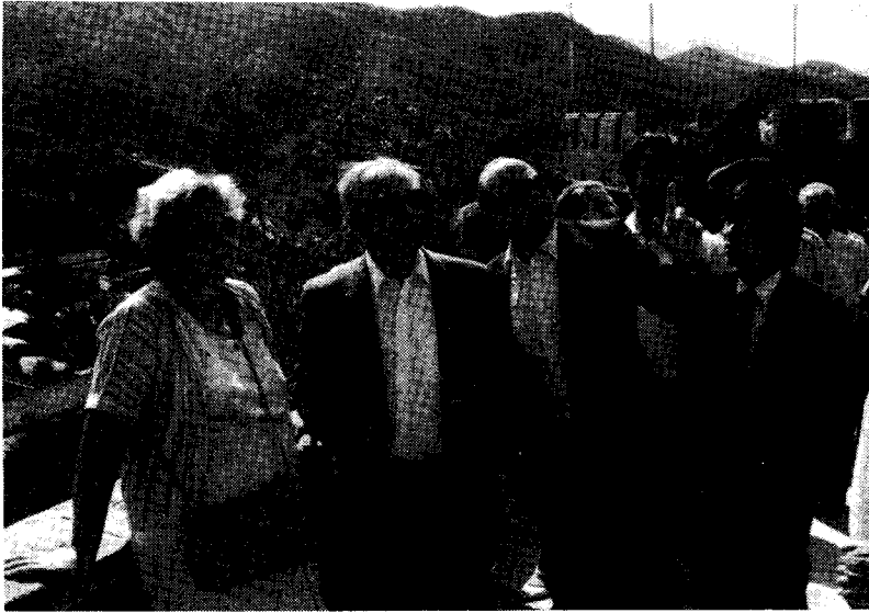
Foreign tourists visiting the Great Wall.