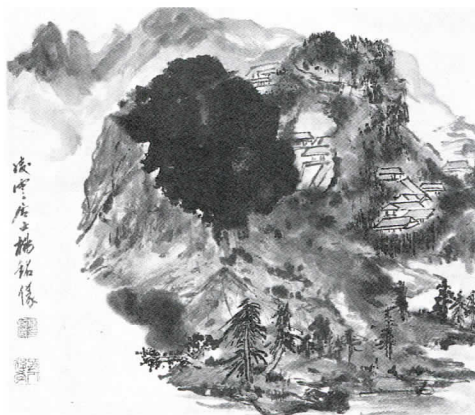
A Family Living Near the Mountains.