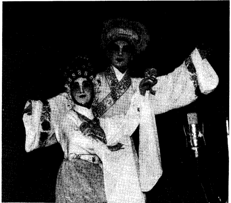
A scene from the Yueju Opera "The Story of Zhujixiang."

In recent years, traditional Chinese operas faced many chal-