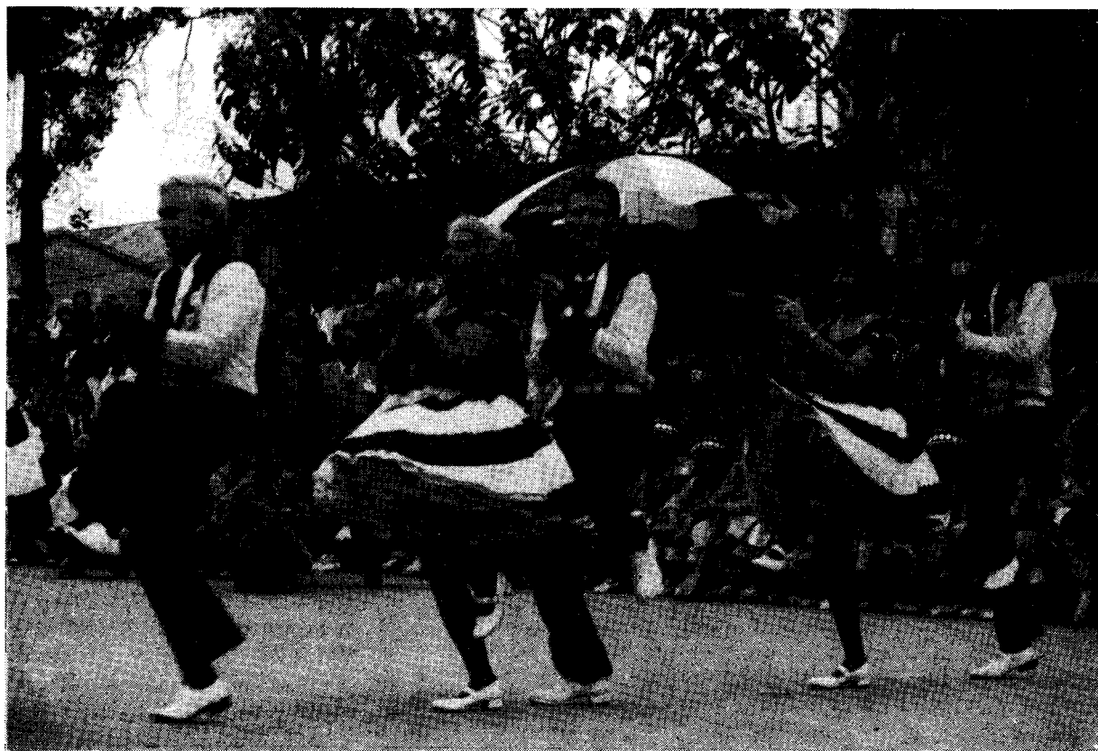
American tourists at a dancing party given by minority people in Yunnan.

China now has 61 first-class travel agencies and 834 second-class ones, most of which were set up in recent years. Some of them are not qualified to operate and some are operating illegally. The sole aim of the consolidation begun last year, however, is to strengthen management. Those which operate without the proper operating conditions will be reor-