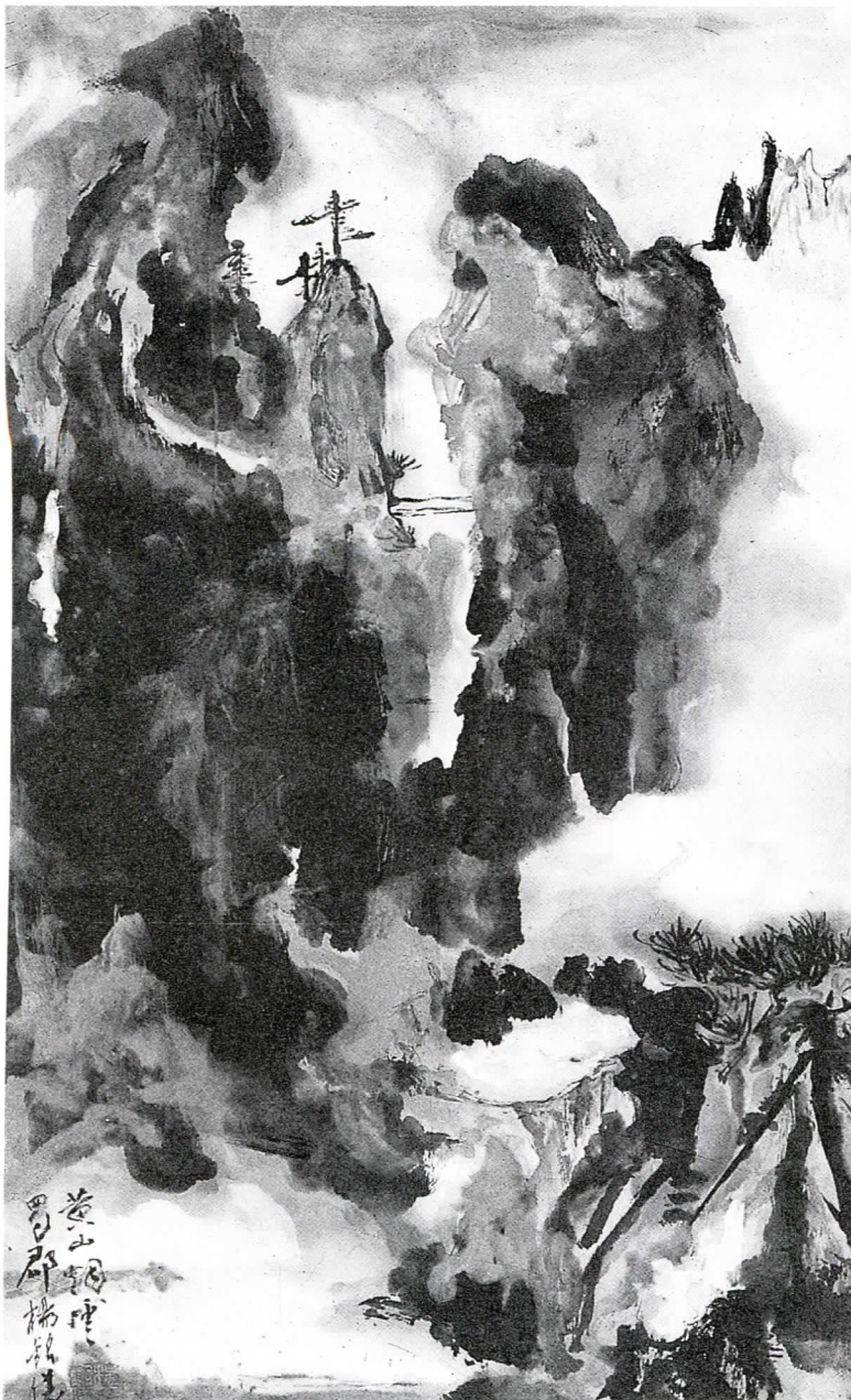
Huangshan Mountain Shrouded in a Veil of Mist.