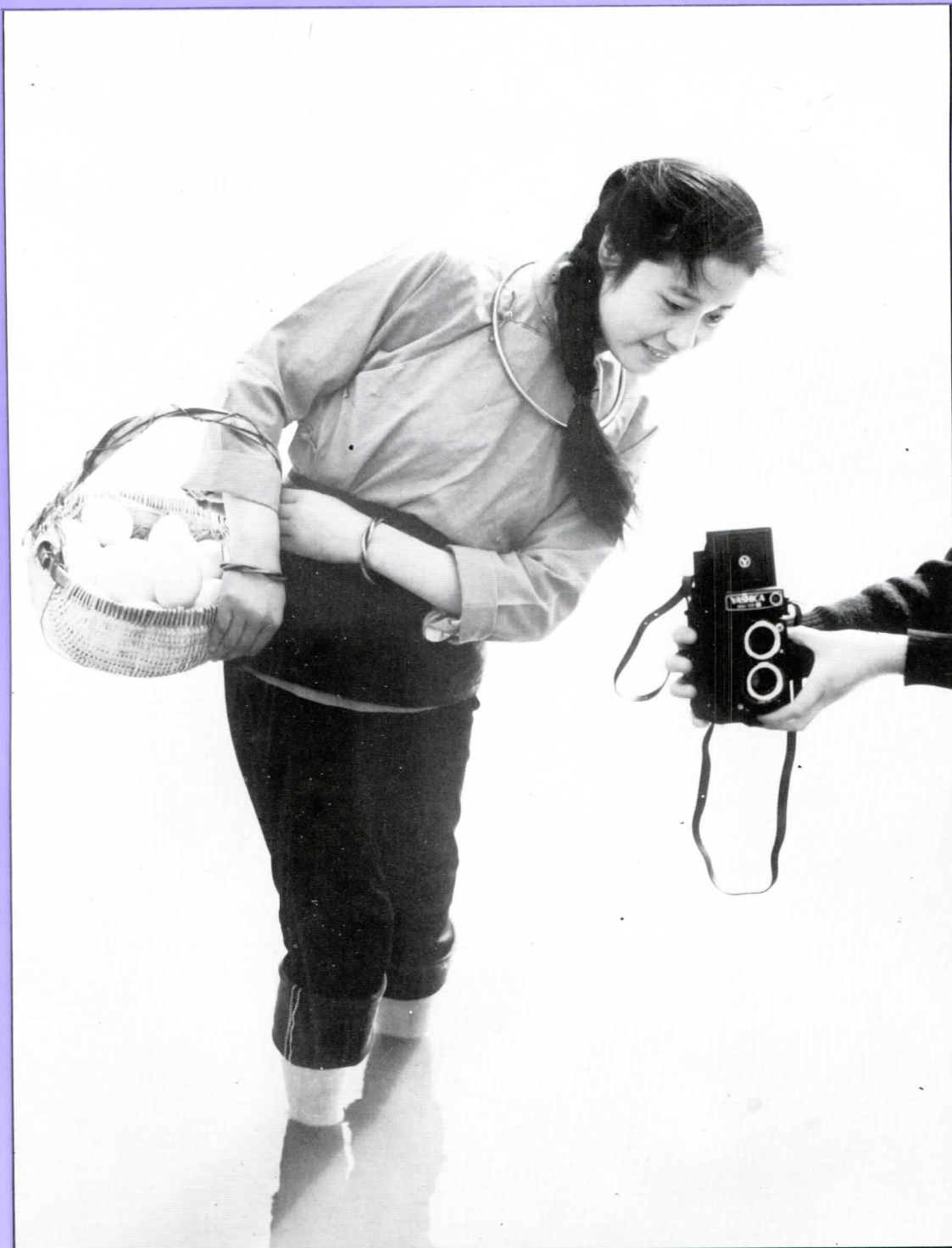
Taking a peep at my beautiful hometown scenery through a camera.