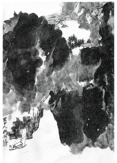
River, Mountains and a Returning Boat.