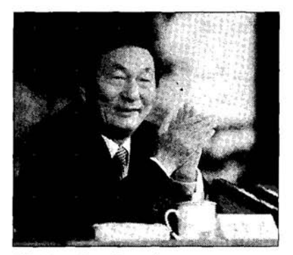
Zhu Rongji smiles as he greets reporters at his first press conference on March 19 after his election as the premier.

Q: Last week, I observed village elections in Jilin and Liaoning provinces, which generally enable villagers to elect their leaders. Would you personally endorse such a system which will allow all Chinese above age 18 to choose not only their local leaders, but also national leaders, including state president and premier?