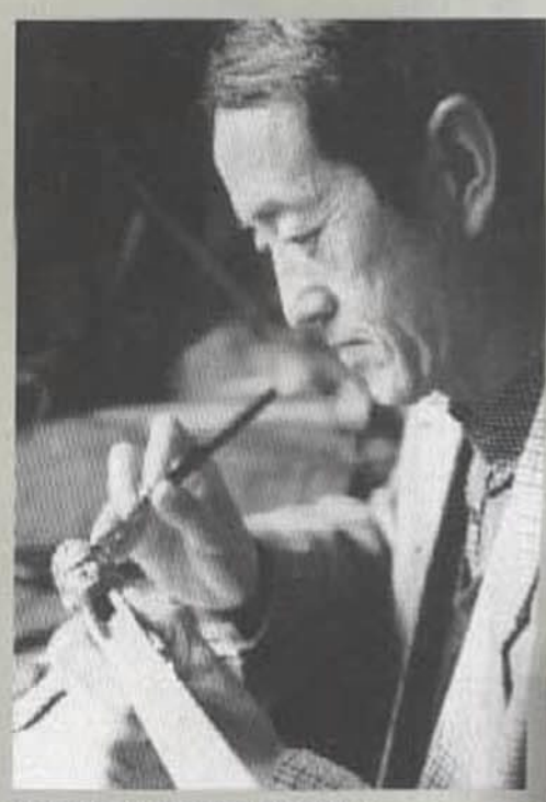
The meticulously-carved violin hood.

Xi/a invention has been registered with the Patent Office of the People's Republic of China, winning him the title of China's Great Master in Violin manufacturing.