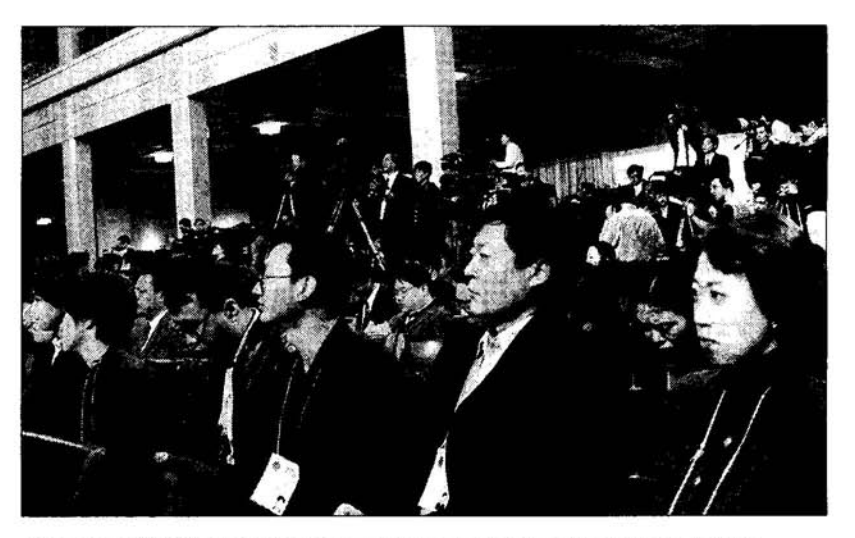
More than 600 Chinese and foreign correspondents attend the press conference.

Q: When China thought about carrying out the reform of stateowned enterprises, Republic of Korea's conglomerates were quite successful. Since the upturn