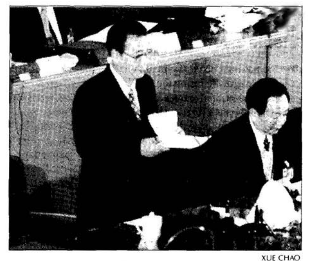
Li Peng, newly elected NPC chairman, outlining NPC's task.